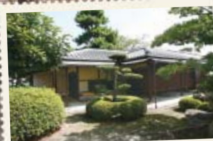
Tea Ceremony House